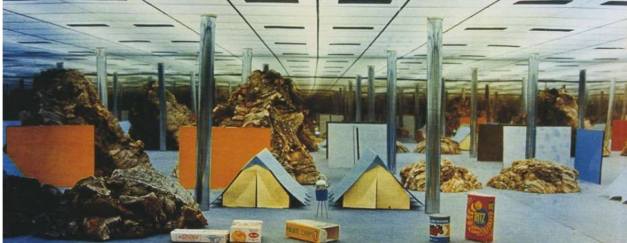
Archizoom, No Stop City

This project will deal with “non-spaces” and zones of temporary “autonomy” or “freedom”. How might utopia be realized in what would otherwise be non-utopian space. Who does the utopia benefit? How might it grow or dissolve? Further details TBA.