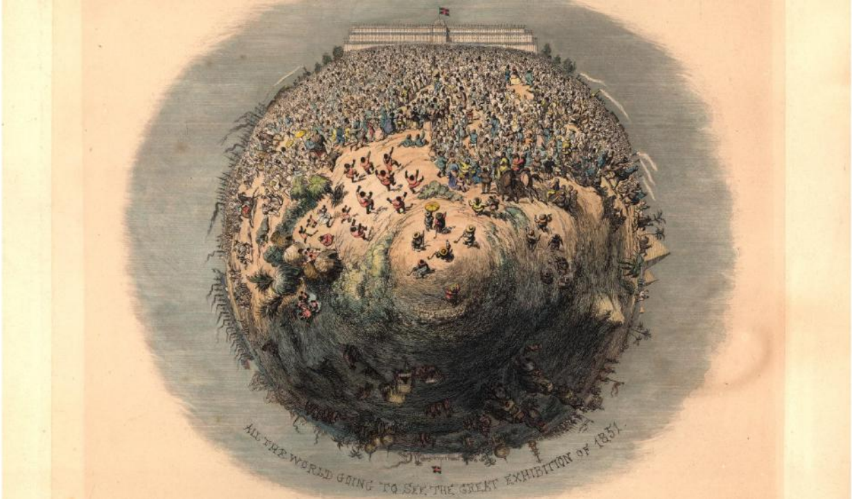
George Cruikshank, All the World Going to See the Great Exhibition of 1851 , 1851

Within the past few years the concept of the Anthropocene has gone from obscurity to the center of critical discourse. The idea that humans have shaped the planet to the extent that they have effectively enacted a geological era is in many ways now perceived as quite commonsensical. For this project, we will look at and discuss how artists are responding to ecology and humanity's position therein as well as speculative scenarios from fiction and science fiction. This project will take the form of a speculative scenario and fully developed proposal (drawings, models, materials list, concept description, video, other pertinent research) that attempts to address a plausible distant future. Additional parameters TBA.